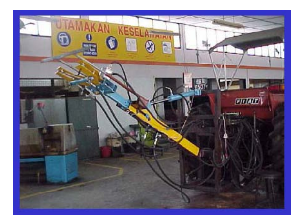
Figure 3: String Cutter Oil Palm FFB Harvester